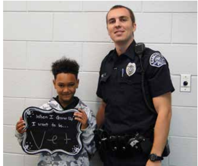
Six officers from the Kannapolis Police Department are serving as Bigs at Forest Park Elementary.

Your holiday gift to Big Brothers Big Sisters will help us reach even more children in the year ahead, changing more lives for the better, forever! Thank you for your support.